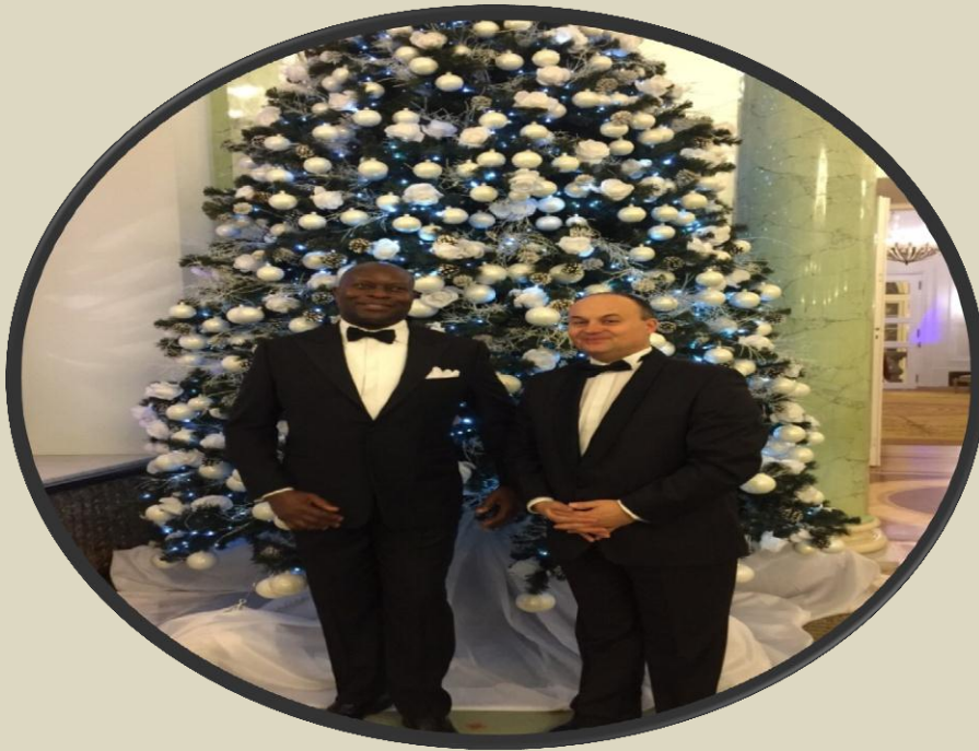
H.E with a colleague during presentation of Credentials in Poland