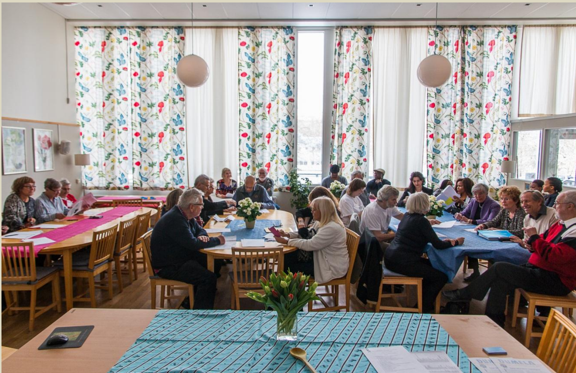
BOTSFA members during Annual General Meeting