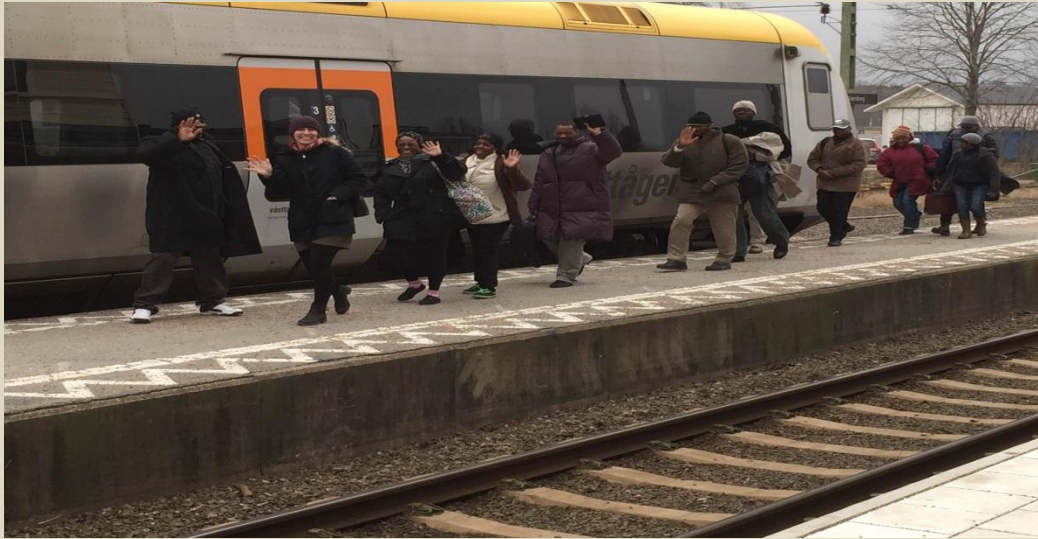
Chobe District Council delegation leaving Vasteros