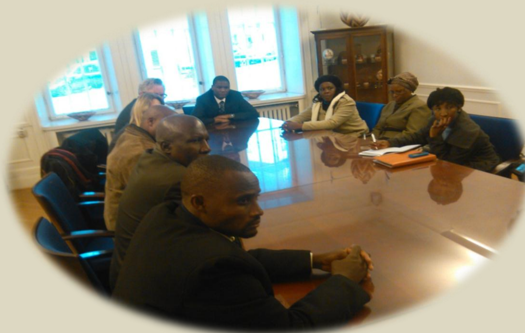
Chobe District Council paying courtesy on the Embassy