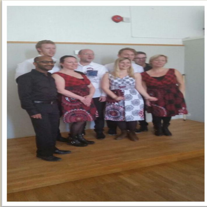
Blue Congo Choir during BOTSFA Annual General Meeting