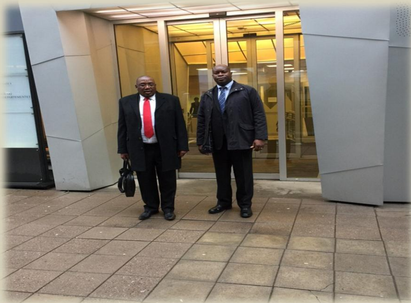
Minister of Trade Hon. V.T Seretse and Amb. Nthekelela