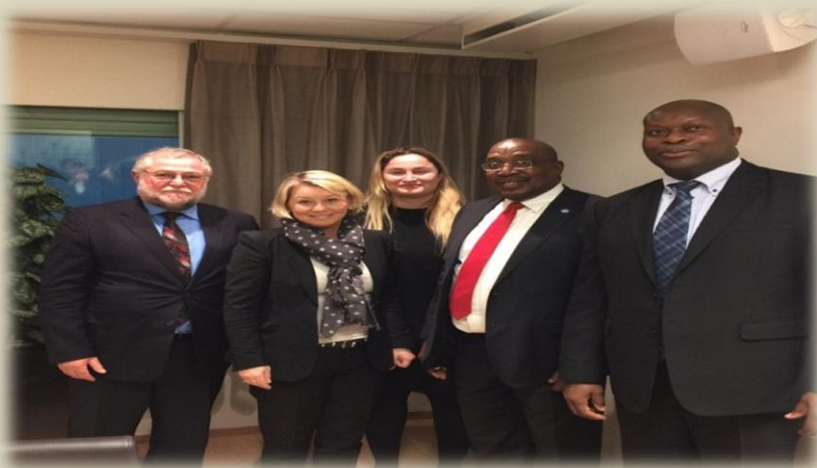
Minister of Trade of Namibia, Norway and Botswana

The Minister of Trade and Industry Hon. Vincent Seretse attended a meeting with his Norwegian and Namibian counter-parts on the 26 th January 2015.